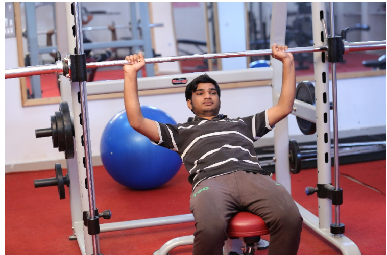
Facilities for disabled